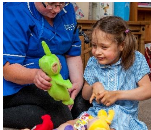
Fun Activities and Engaging