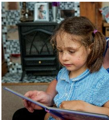
Learning and Developmet