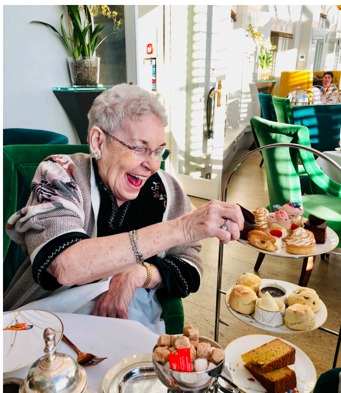
Afternoon tea at the Brighton Grand hotel

Did you know our services extend outside the home? Many of our clients enjoy a visit to the cinema or a walk in the fresh air, along the seafront. Perhaps you would like to look forward to a lunch or coffee, combined with a trip to a garden centre or National Trust property? We can find a friendly companion to help you to continue enjoying whatever makes you happy.