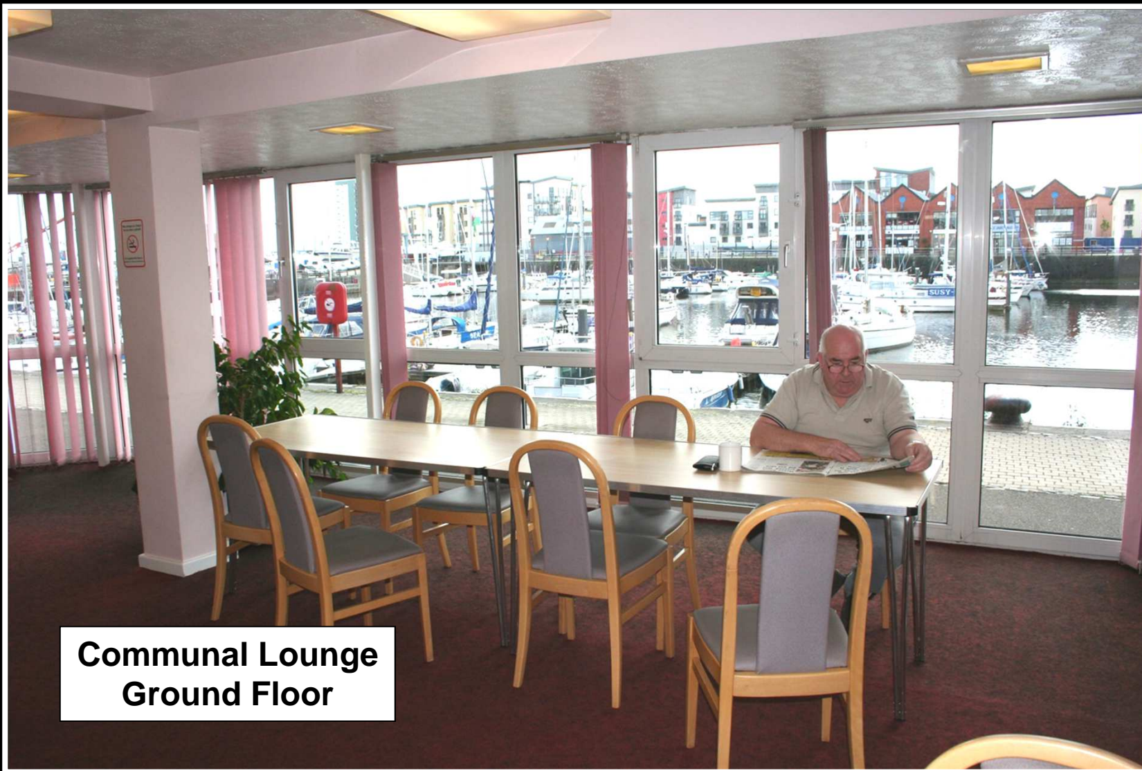
Communal Lounge Ground Floor