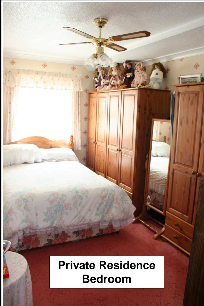
Private Residence Bedroom