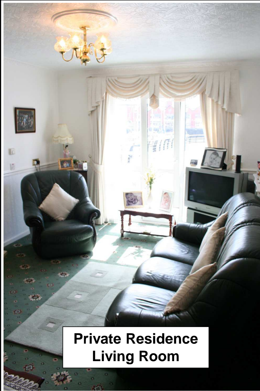
Private Residence Living Room