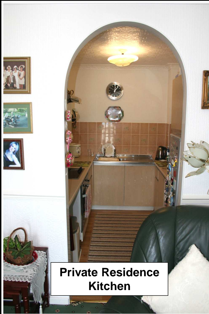
Private Residence Kitchen