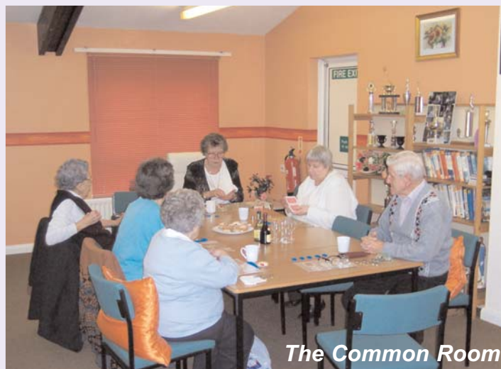
The Common Room