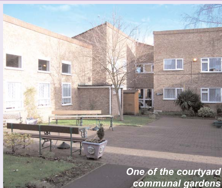
One of the courtyard communal gardens