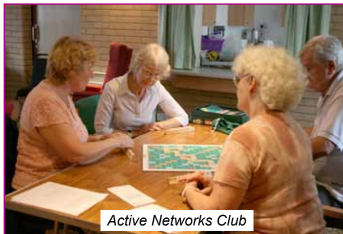
Active Networks Club