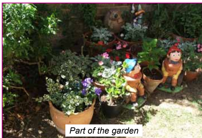
Part of the garden