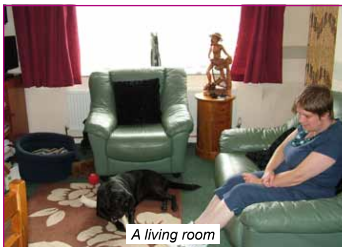
A living room

To find out more or to arrange a visit please call (01983) 822811.