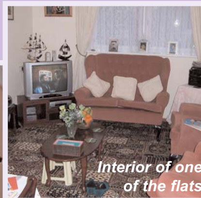
Interior of one of the flats