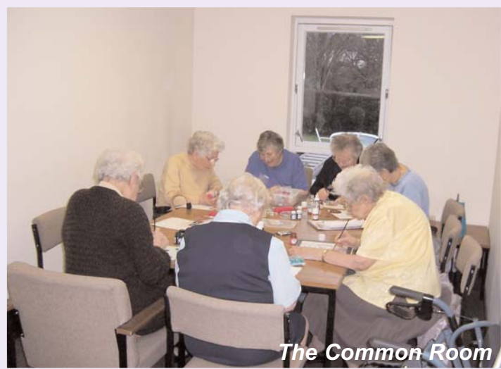
The Common Room