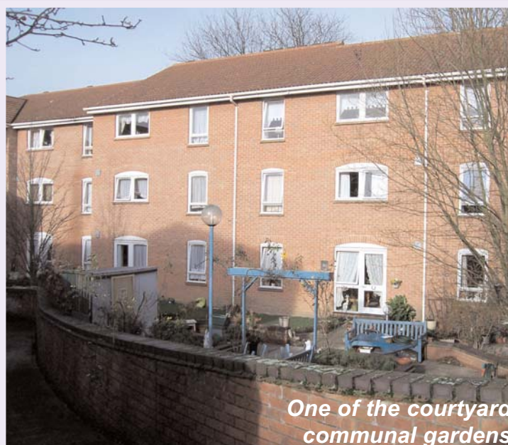
One of the courtyard communal gardens