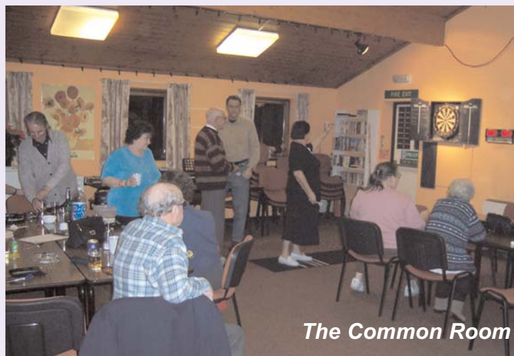
The Common Room