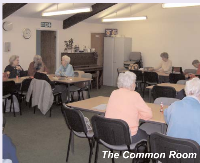
The Common Room