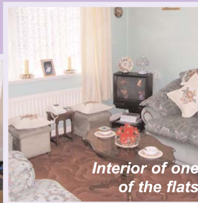
Interior of one of the flats