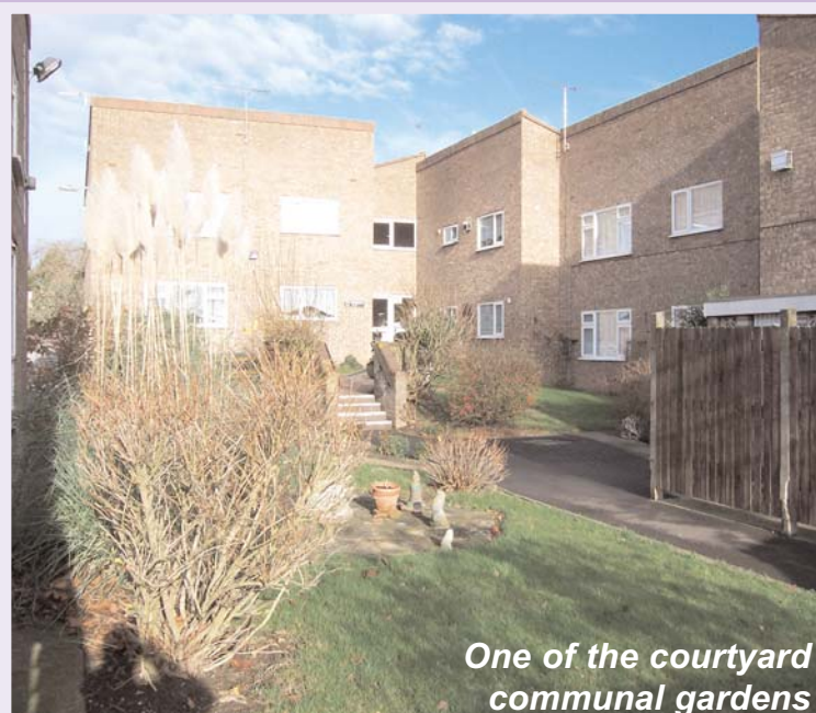
One of the courtyard communal gardens