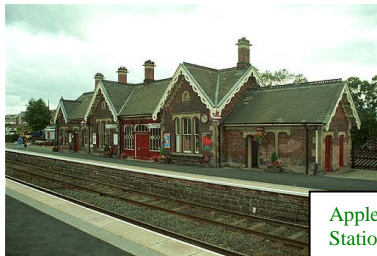
Appleby Train Station

Rampkin House is situated in the small Market Town of Appleby in Westmorland. Appleby is situated on the A66 making it convenient for visiting areas of interest within the Eden Valley. The nearest larger town is Penrith approx 15 Miles away.