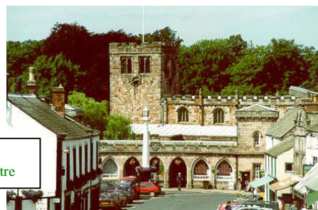
Appleby Town Centre

Appleby has many shops, walks, and interesting places to visit, which are all easily accessible.