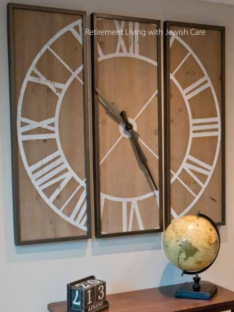
Retirement Living with Jewish Care