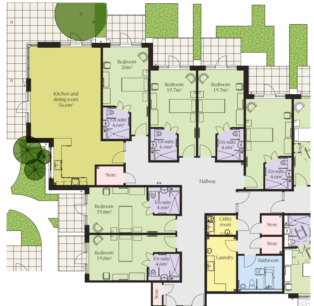
Typical household floorplan

The households and care home have 24-hour outdoor CCTV as well as outside lights with passive infrared sensors in all communal areas for safety. There's also a 24-hour emergency call system direct to the on-site care team if you should need it.