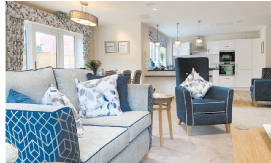
Household living area

There's also lots for residents to enjoy and get involved with. Days are busy and engaging, while peaceful evenings should lead into a better night's sleep. For relaxation there's watching a favourite TV show, going for a stroll, reading quietly, or listening to the radio. We also plan lots of activities, events and supported days out for residents to enjoy.