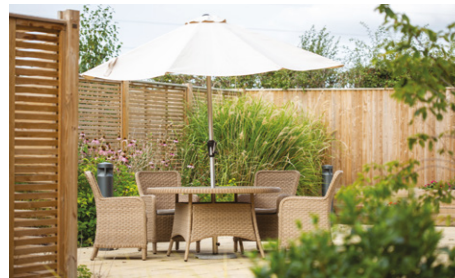
Household outside space