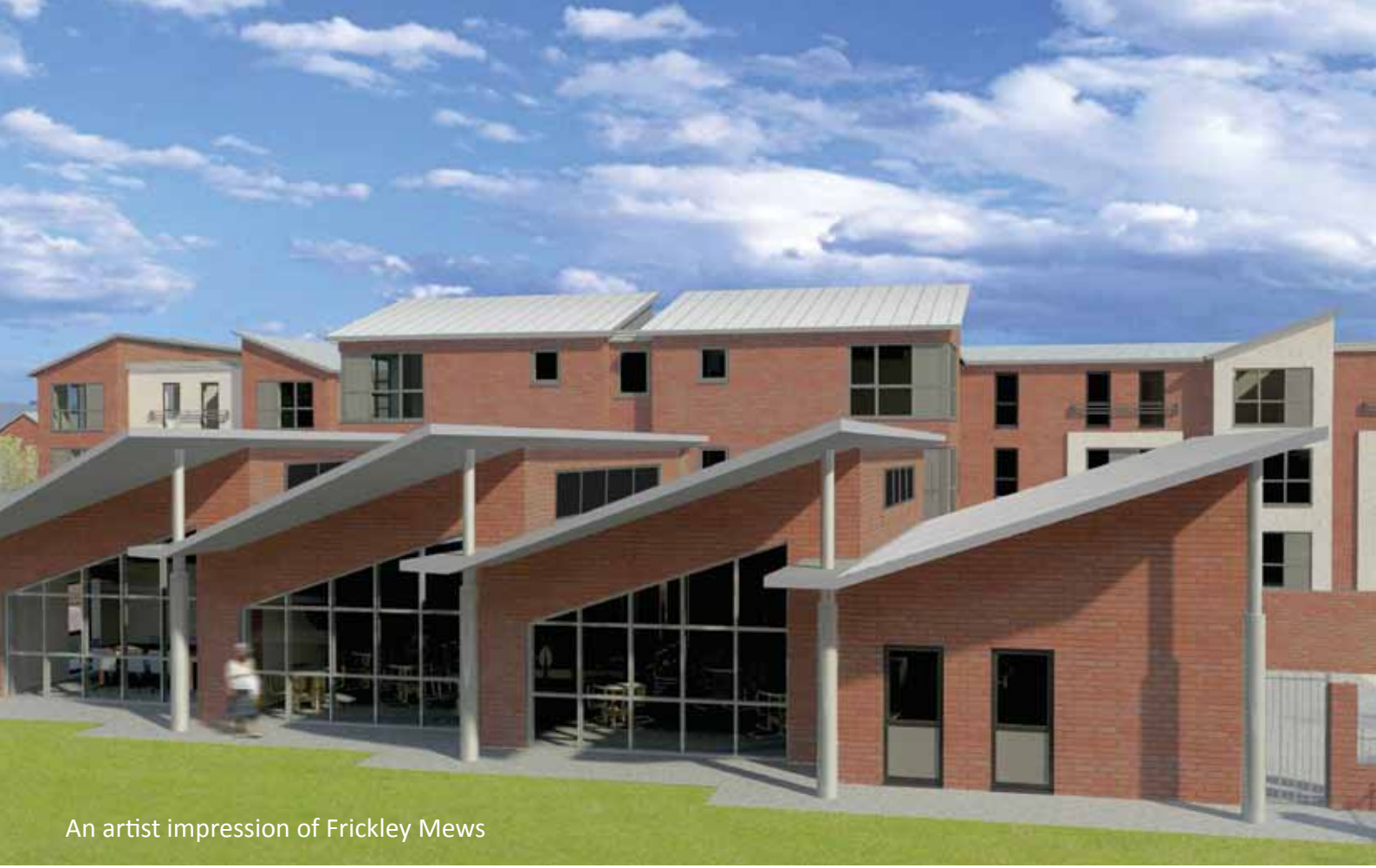
An artist impression of Frickley Mews