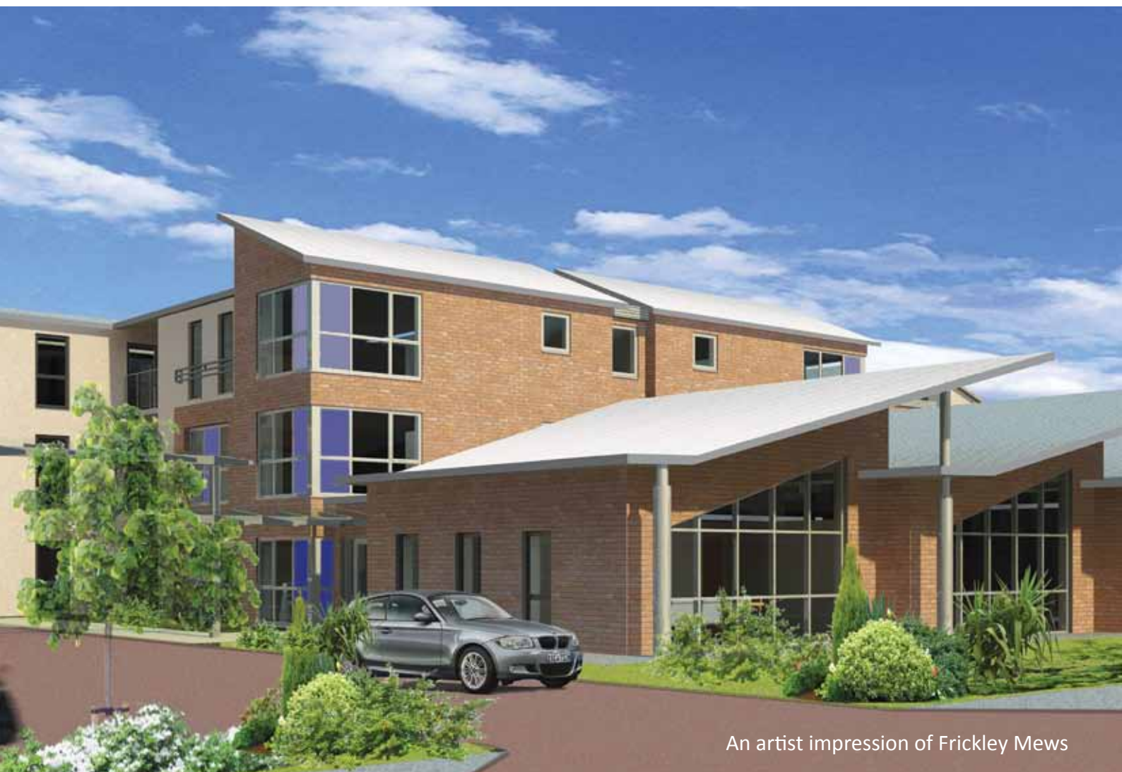
An artist impression of Frickley Mews