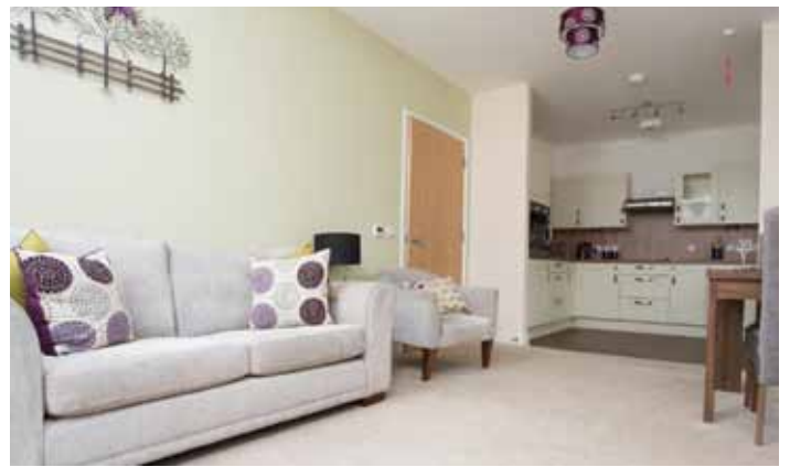
Example of an apartment layout