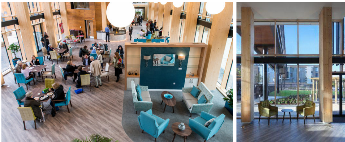
Bistro with fold-back glazing

Village 135 facilitates integration with the local community (including the two existing, age-restricted tower blocks) with public access to the Bistro, Salon, Spa and Gardens. The security of Village 135 residents is addressed through natural surveillance and access control.