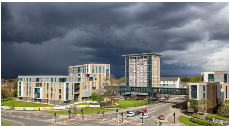
Overview of the development

WCHG manages 14,000 properties providing homes for over 20,000 people across Wythenshawe. Village 135 creates housing to meet the needs of the local and wider community, increasing the population of this location and enhancing the urban landscape. This makes the facility central to the wider Wythenshawe Regeneration Framework Plan and an integral part of Wythenshawe Community Housing Group commitment to the Manchester Age-friendly charter.