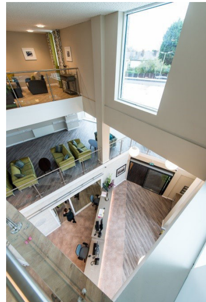
Atrium in communal space

A designated scooter and cycle store is provided with changing points. General storage within apartments is adequate for day to day requirements.