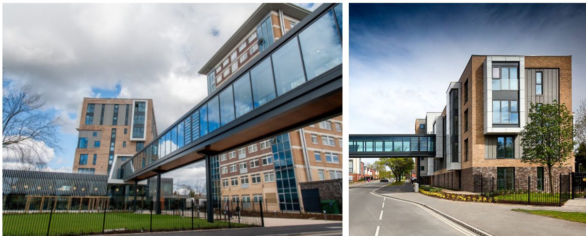
Footbridge connecting the two sites

Village 135 creates a landmark building, responding to the diverse architectural scale in the vicinity, the height of the existing tower blocks, the removal of the roundabout to facilitate the Manchester to Airport Metrolink line and the replacement of the pub/office building with the new Manchester College building.