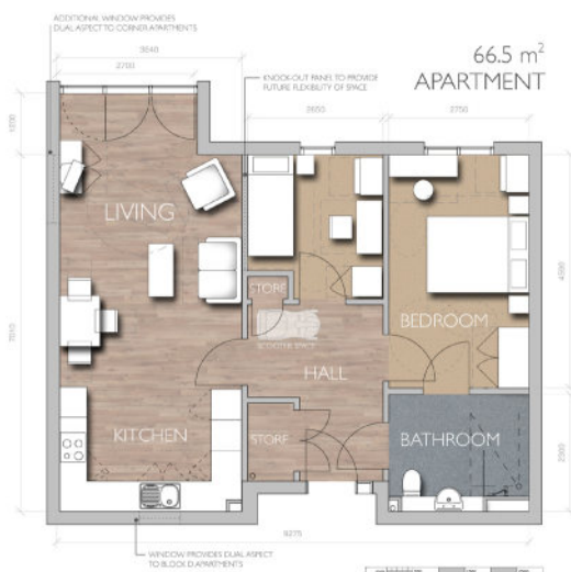
Typical apartment layout