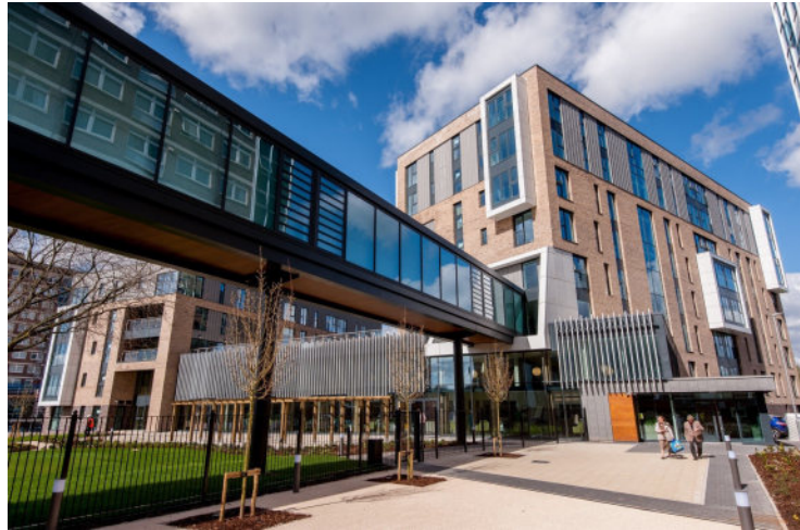
Footbridge to the Hollyhedge site

The location of the scheme complements local amenities as it is adjacent to a Health Centre and nearby local shops which include a post office, pharmacies, bakeries, newsagent / convenience store, local supermarkets, cafes and fast food shops. Bus services and the adjacent Metrolink Tram stop connect to Wythenshawe Town Centre, Wythenshawe Hospital, Manchester Airport, South Manchester and the City Centre.