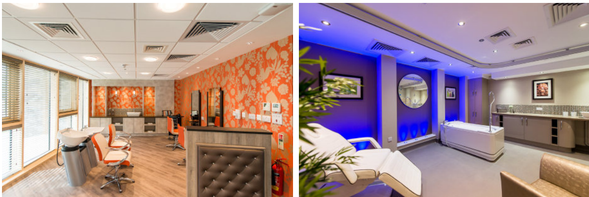
Hair & Beauty salon and Spa-Bathroom

The Community Hub of approx. 2000m 2 includes: