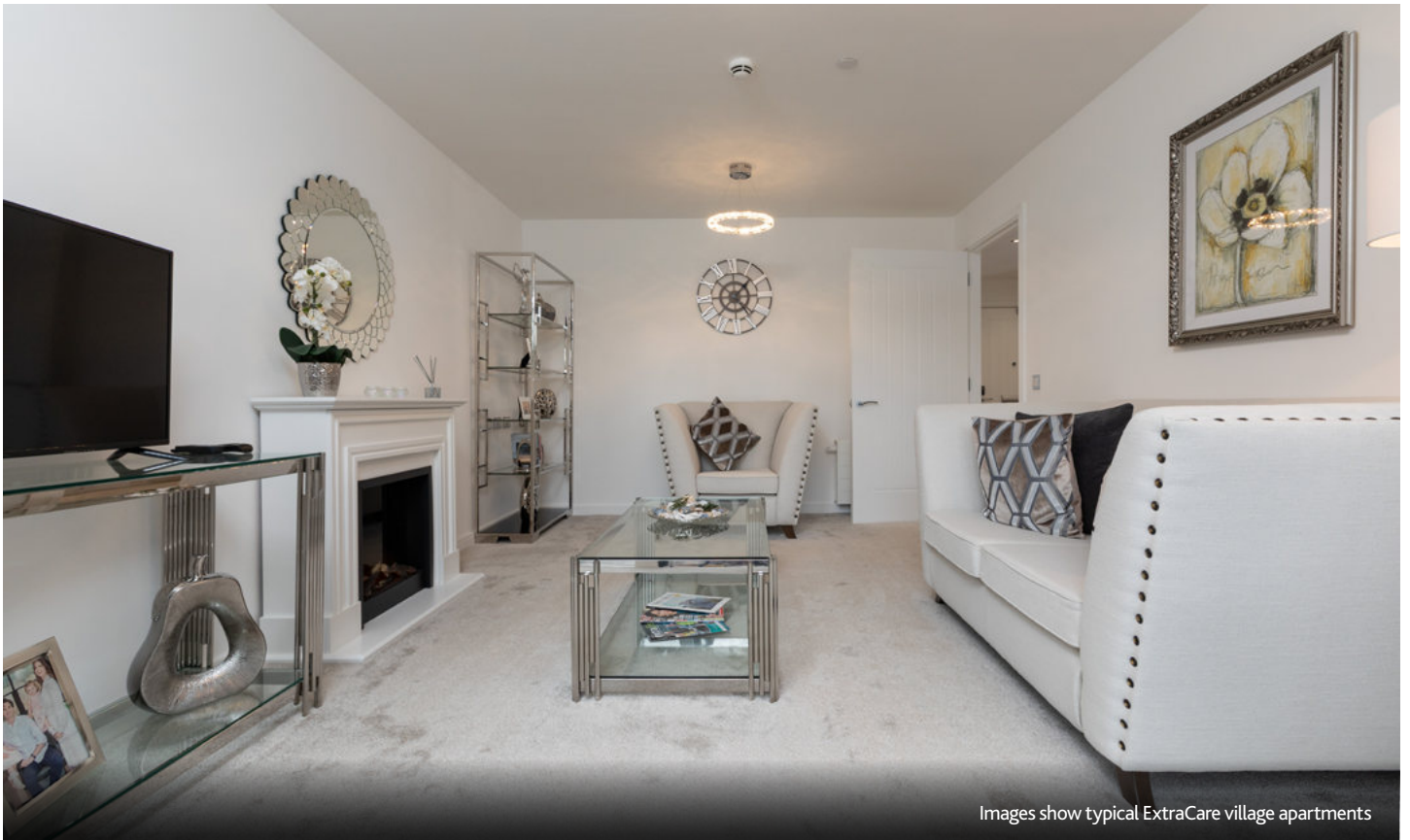
Images show typical ExtraCare village apartments