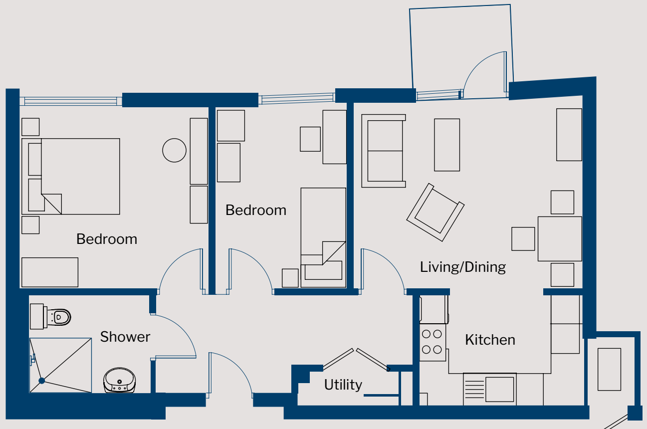
Two-bedroom flat - all flats come unfurnished