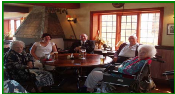
External activities take place regularly

It is possible to access Internet shopping or use e-mail to keep in touch with friends and family.