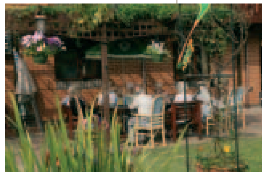
The outdoor seating area at St Anns