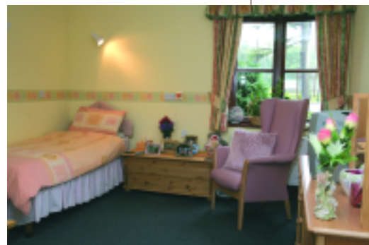
A typical bedroom at St Andrews