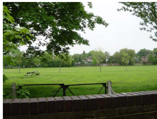
View from Kuala Gardens