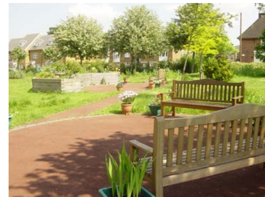
The Garden shared with Garnet Road Sheltered Development