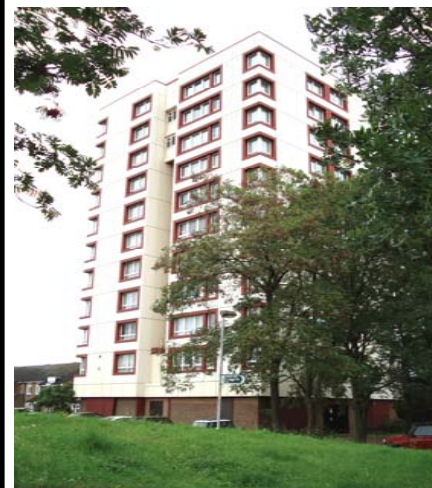
Bridge Place Flats