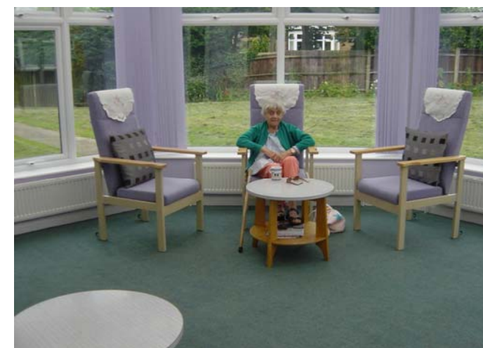
Conservatory and communal gardens