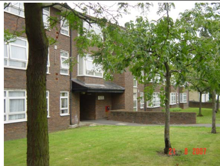
Arun Court Entrance