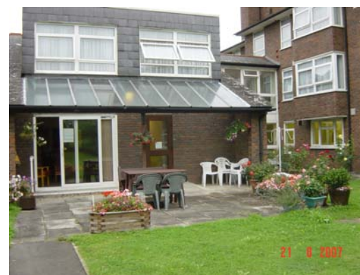
Arun Court Gardens