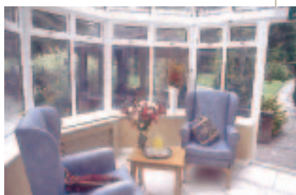
The conservatory at Tremona