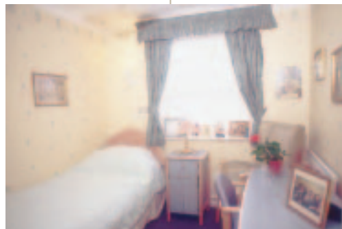
A typical bedroom at Tremona