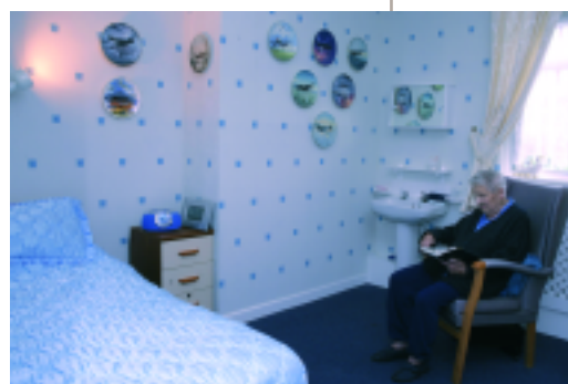
A typical bedroom at St Catharines