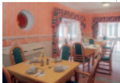
The dining suite at The Lodge