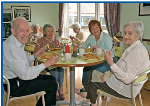
Tenants in Sydenham Court Supported Housing enjoying their luncheon club.

"I look forward to going out to the shops, the girls come with me and afterwards I love to call in for coffee to the wee café afterwards...." (Tenant)