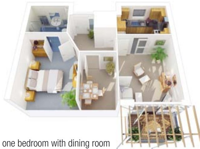
one bedroom with dining room