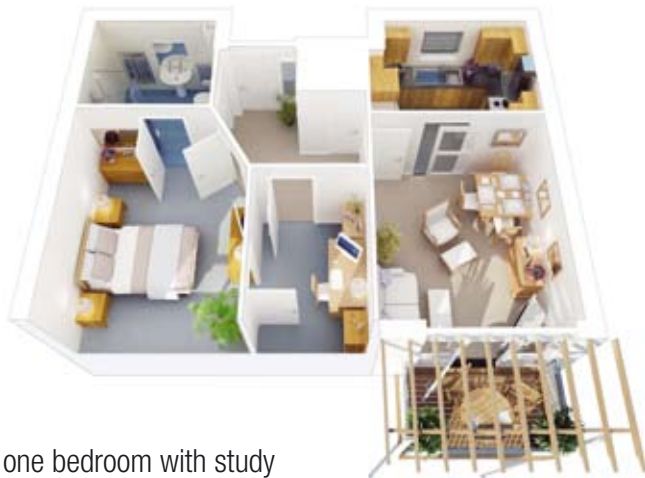
one bedroom with study