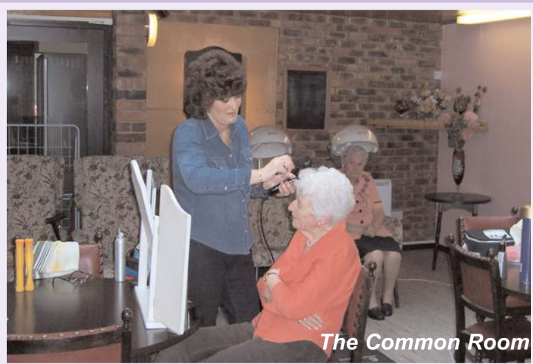
The Common Room