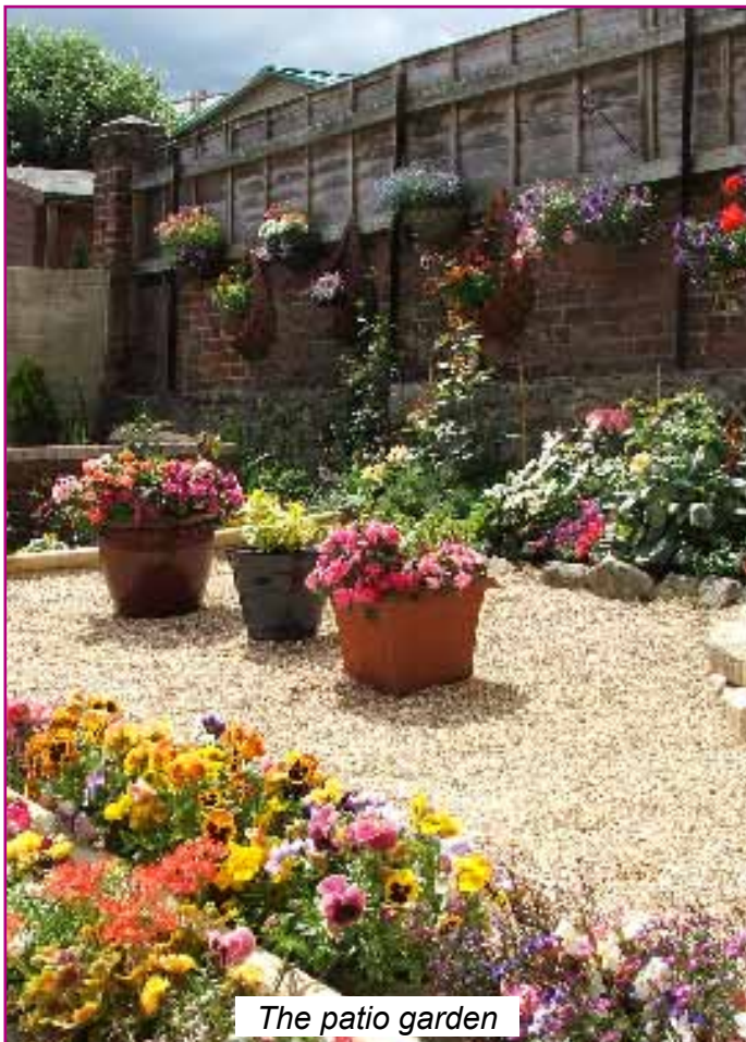
The patio garden

To find out more or to arrange a visit, please call (01983) 822811.