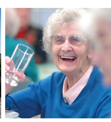
Comfortable one- and two-bedroom apartments designed for later life