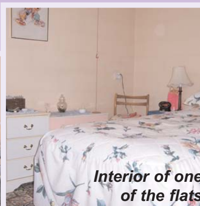
Interior of one of the flats