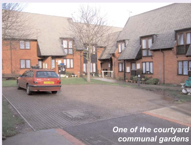
One of the courtyard communal gardens