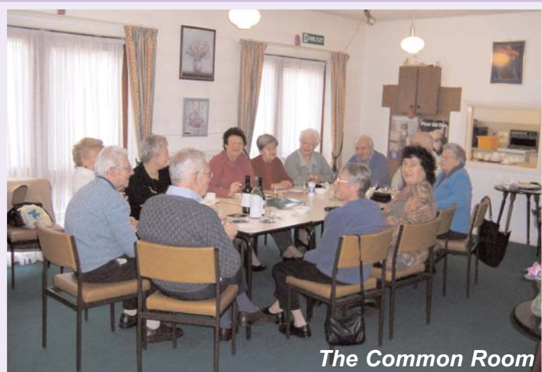
The Common Room