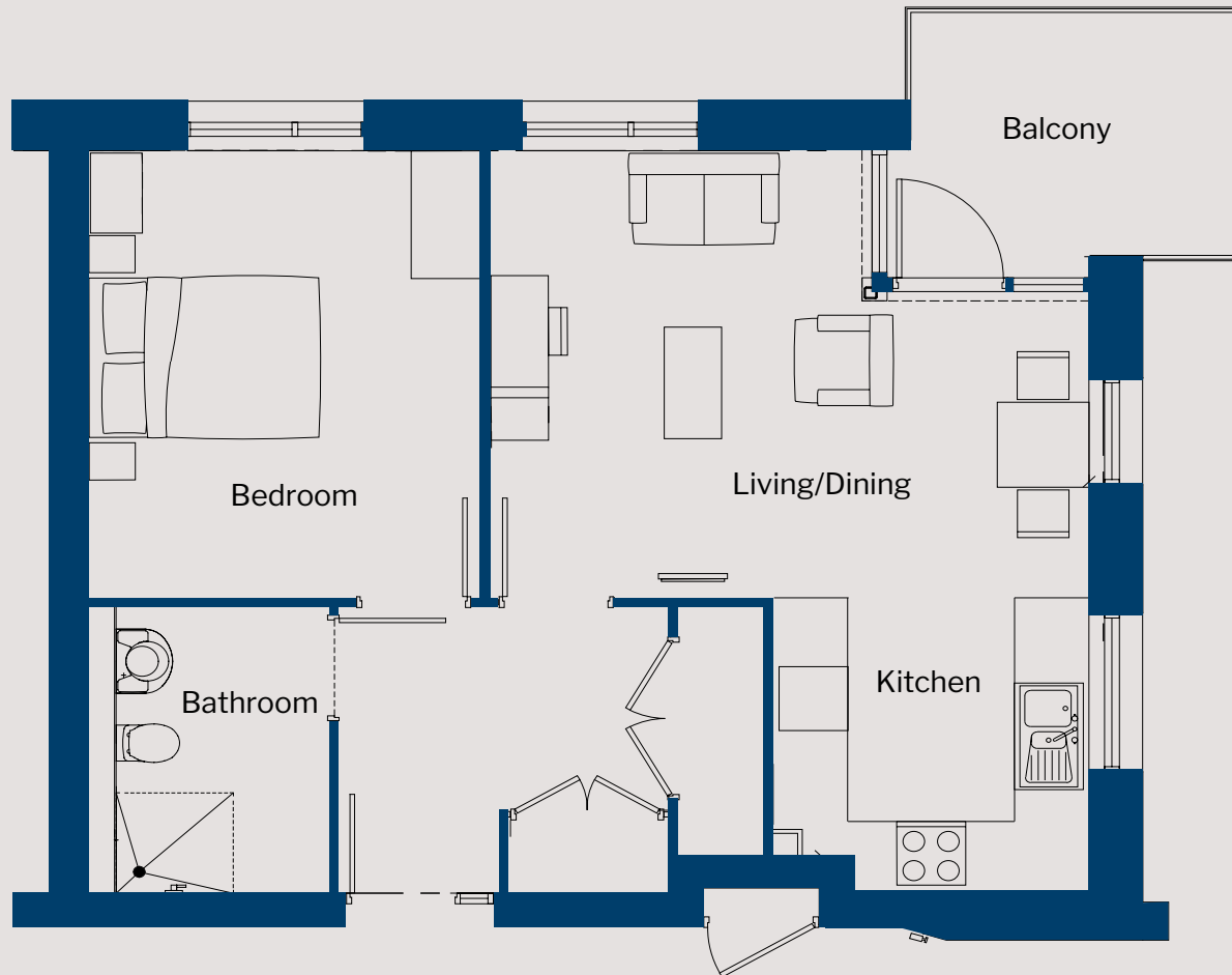
One-bedroom flat - all flats come unfurnished