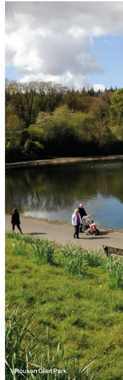
Rouken Glen Park