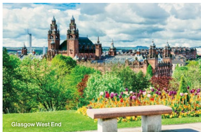
Glasgow West End

Transport links are excellent with regular bus links into the town centre and onto Glasgow and destinations further afield. The town is within easy reach of two railway stations, at Patterton and Whitecraigs, while the nearby M77 motorway allows quick and easy access to Glasgow City Centre. As well as easy access to Glasgow, Newton Mearns lies on the main road to the beautiful county of Ayrshire, where some of Scotland's most striking countryside and coastal scenery lie side by side.