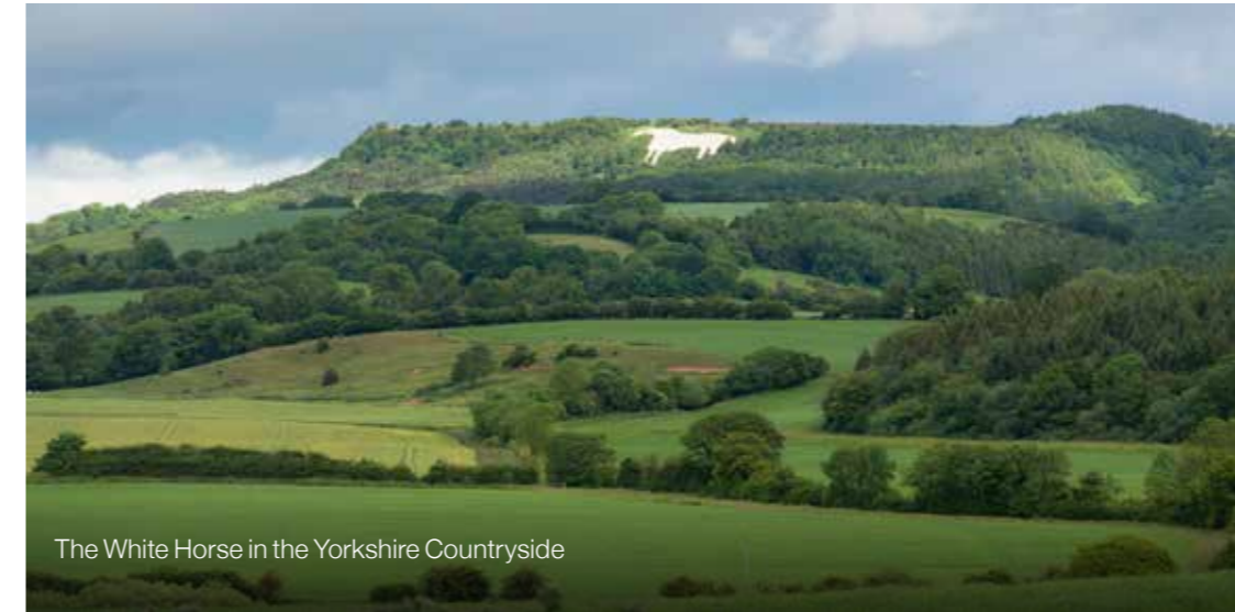
The White Horse in the Yorkshire Countryside

Keeping you close to the things that really matter