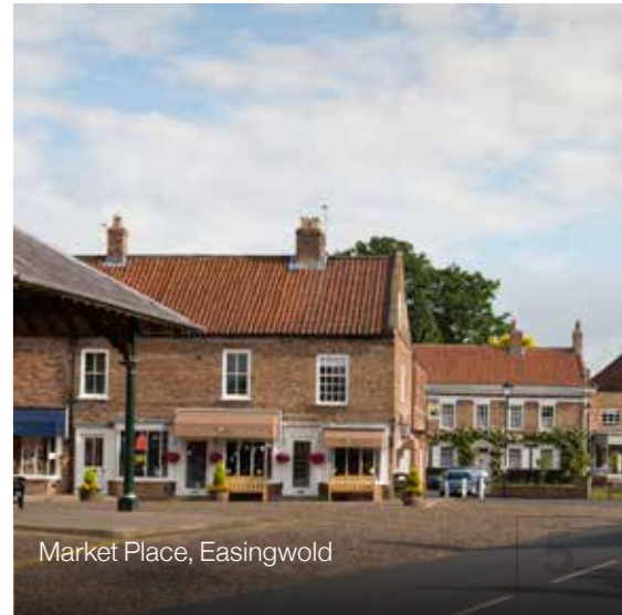
Market Place, Easingwold

Keeping you close to the things that really matter