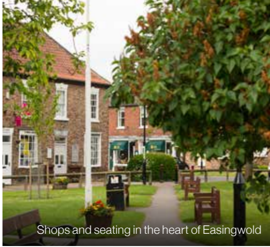
Shops and seating in the heart of Easingwold

A vibrant community in the heart of Easingwold