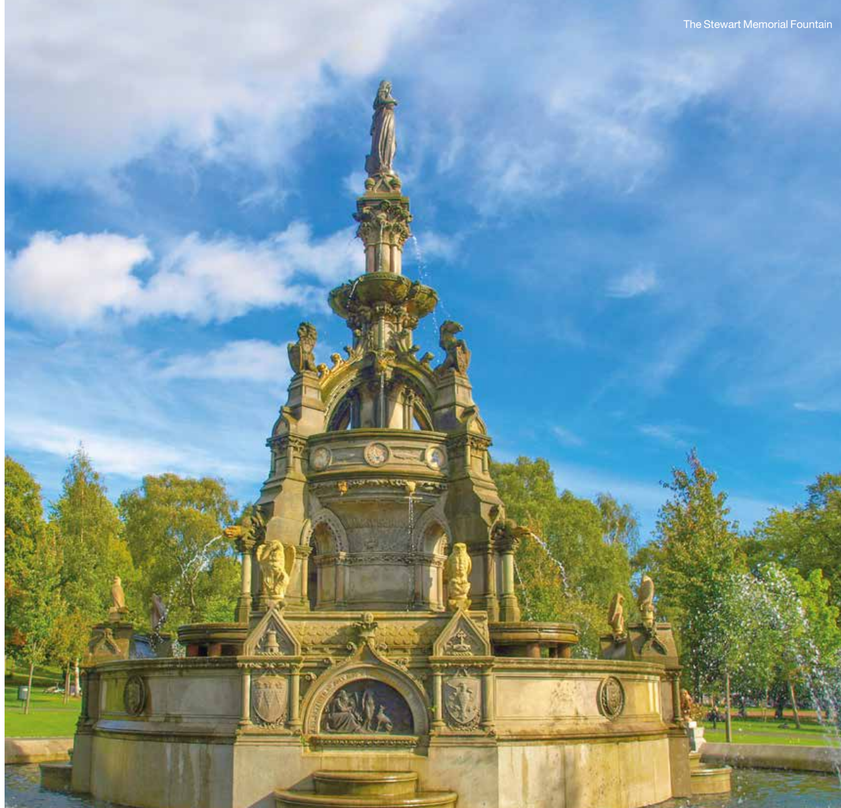
The Stewart Memorial Fountain

You'll be surrounded by the warmth of friendship