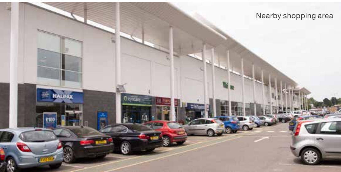
Nearby shopping area

Our locations are hand picked to be close to local amenities