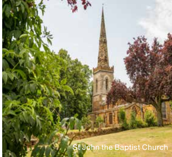
St John the Baptist Church

A vibrant community in the heart of Kingsthorpe