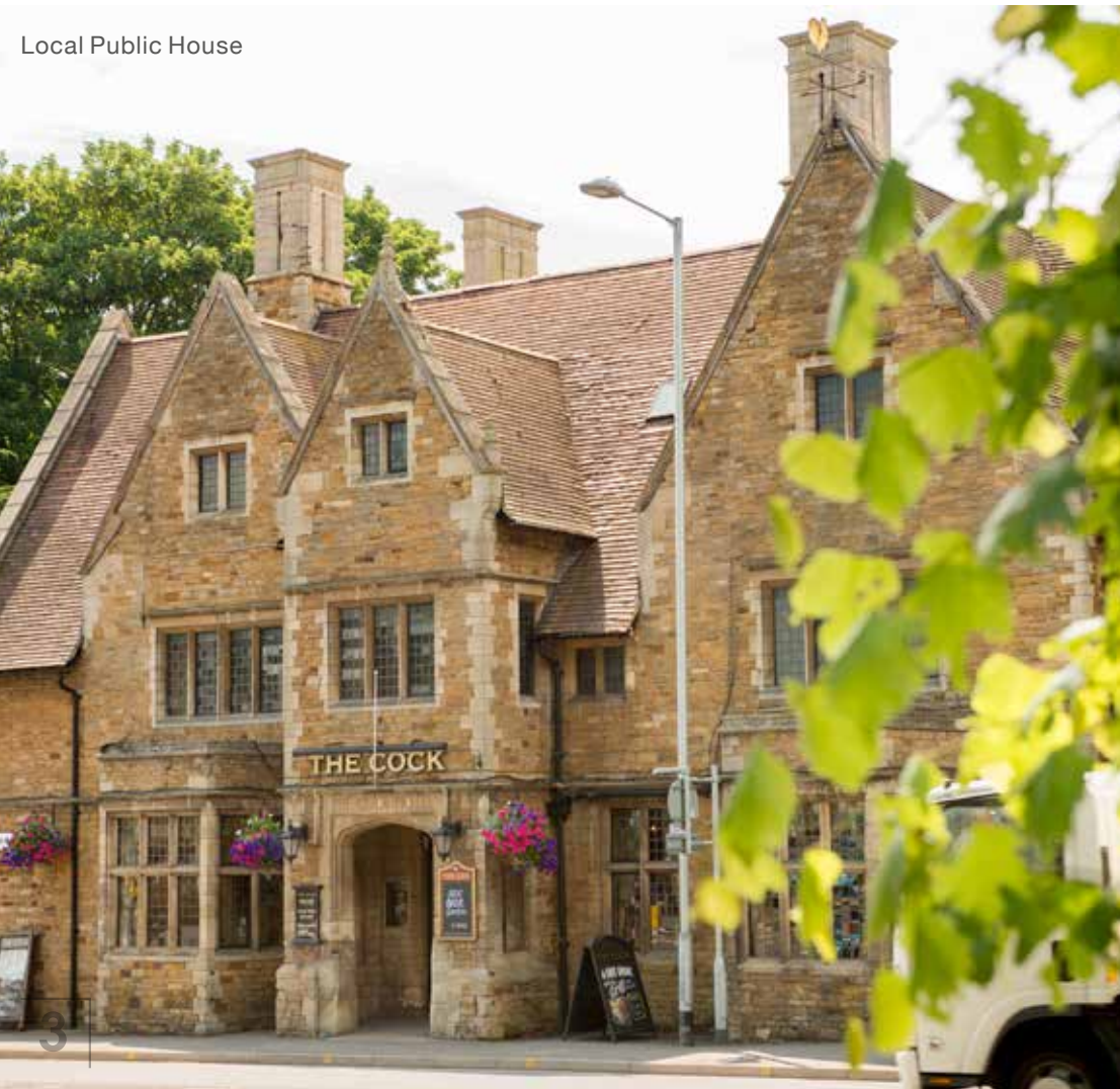
Local Public House

Buses operate regularly within the local area, connecting homeowners to the local shops and amenities as well as Northampton town centre, which is under three miles away. With the main high street just around the corner, you are conveniently located near to many local amenities including supermarkets, banks, opticians, dentists, pharmacies, bakeries, cafés and much more.