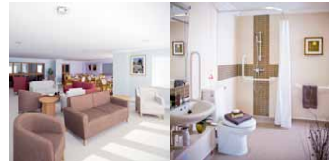
Artist's impression is for illustrative purposes and is only representative of final furnishings and finish.