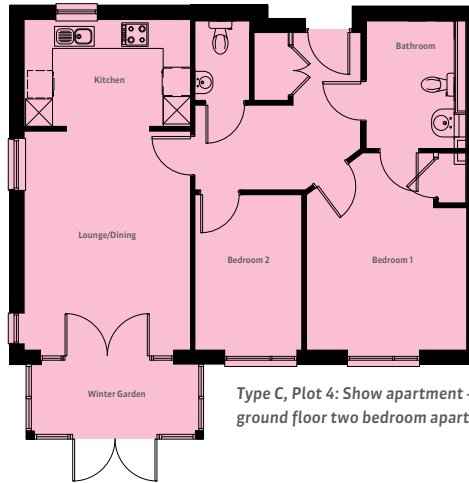
Type C, Plot 4: Show apartment - ground floor two bedroom apartment