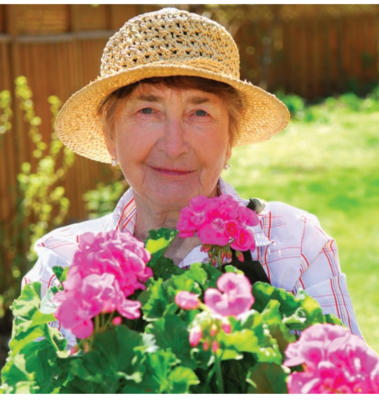
COLWYN BAY LL297BU

Merton Place - an exciting new care home providing specialist nursing services in Colwyn Bay