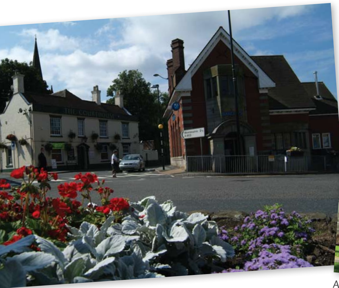
Sedgley town centre