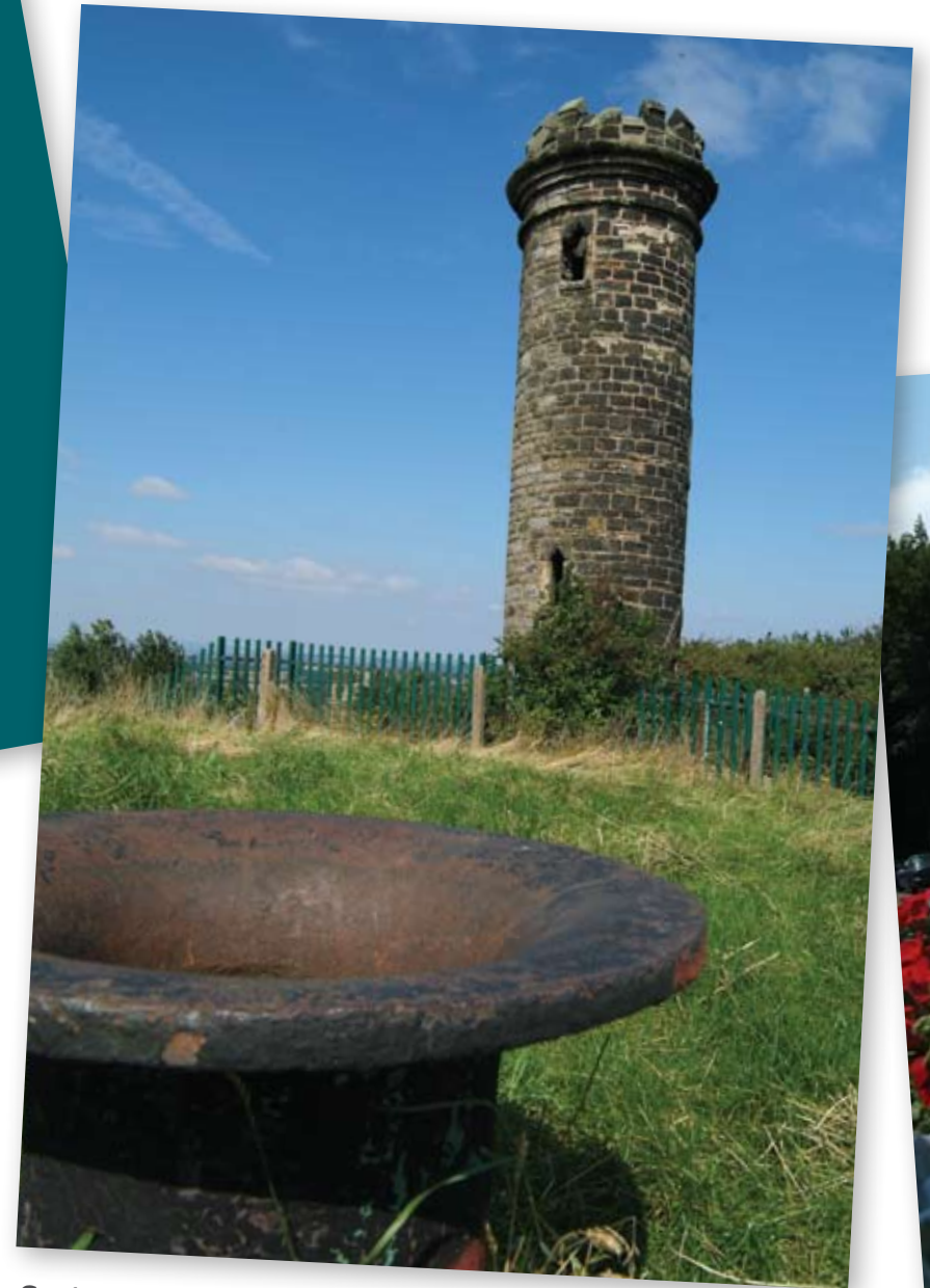
Sedgley Beacon Tower

Or perhaps you prefer something a little more relaxing like the beautifully secluded Baggeridge Country Park with its 150 acres of ancient woodland and walkways just minutes away from the Court, or well-known sites such as the Black Country Living Museum, Wightwick Manor, Bantock House, Dudley Zoo and Castle.