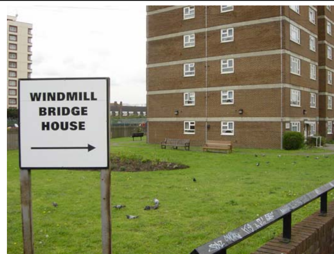
Windmill Bridge House