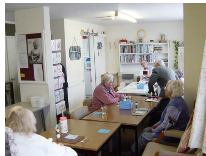
Windmill Bridge House Lounge