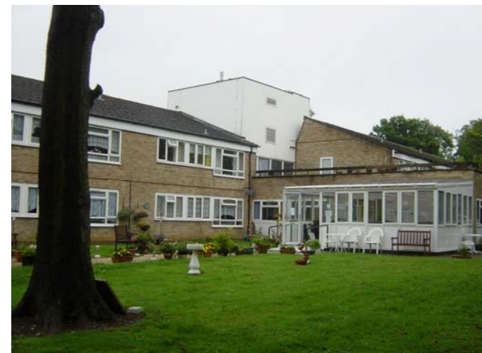
Communal garden and conservatory