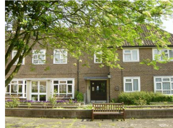
Ashburton Memorial Homes