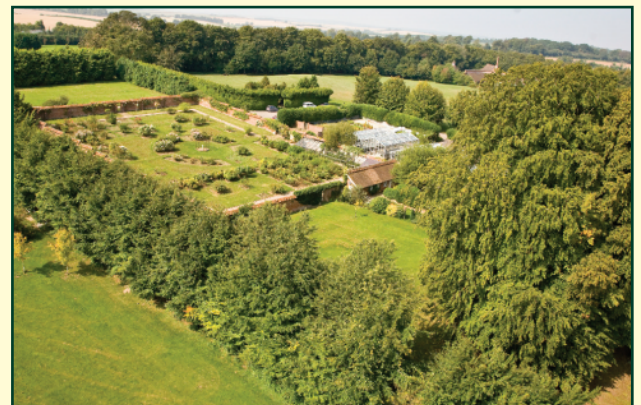
Sutton Manor Grounds

The atmosphere at the Manor is one of tranquility and spaciousness. The expansive surroundings, with 25 acres of peaceful private gardens and 35 acres of parkland, are perfect for leisurely walks and exercising pets. Situated to the south of the Manor is the Nursery area with its greenhouses supplying fresh flowers and plants for all Amesbury Abbey Group Nursing Homes.