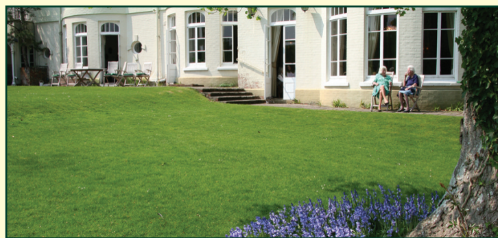
Sutton Manor Gardens