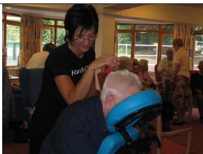
Hands on Massage Session

We are always very keen to hear any suggestions for activities that you would like to do and will do our best to make them happen.