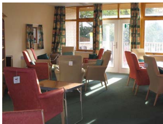
Lower Ground Lounge

The communal lounges are situated on the lower and ground floors. The lounge on the lower ground floor has access to a decked area overlooking the landscaped garden. Both lounges are used for main social activities, including a weekly coffee morning